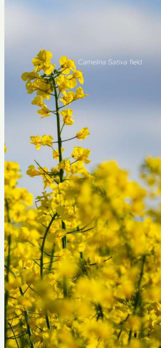
Camelina Sativa field